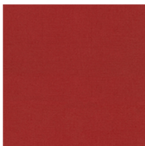
new cherry red